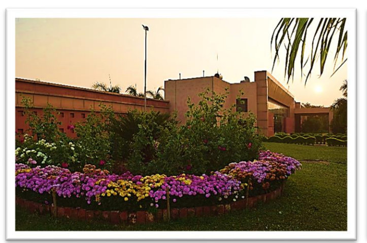
Auditorium - 2