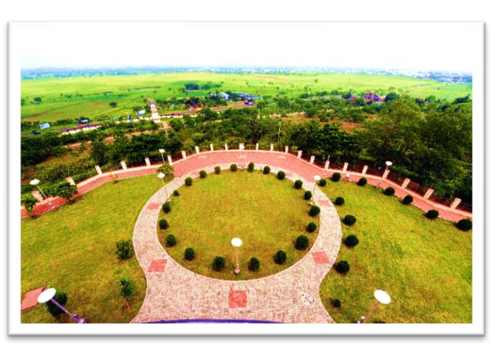
Bayview, Executive Residence -2