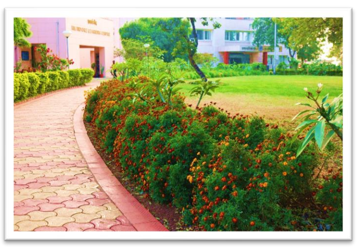
Pathway to Library & Admin Block