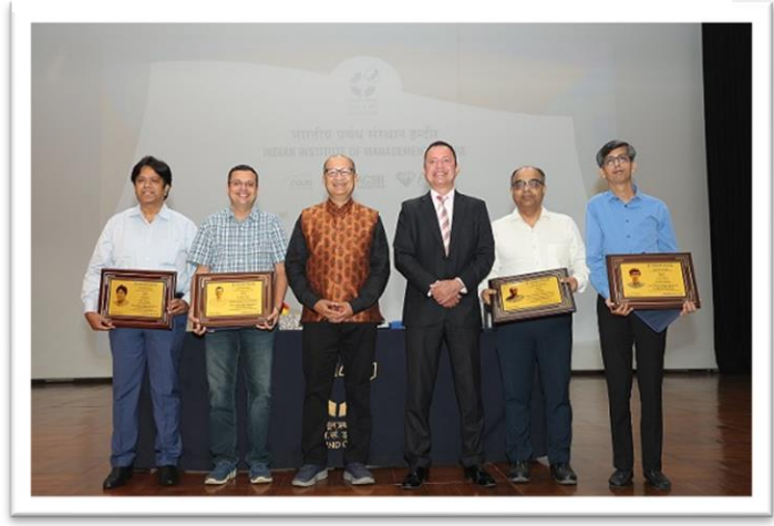
Felicitation of support staff for their honesty and hardwork