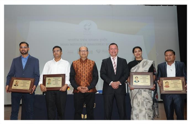
Employees associated with IIM Indore for 10 and 20 years were felicitated