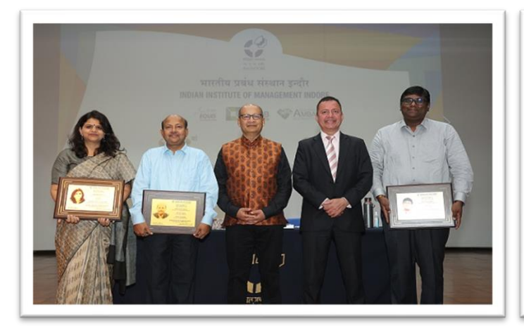
The top five percentile faculty to receive the highest feedback from the students were felicitated