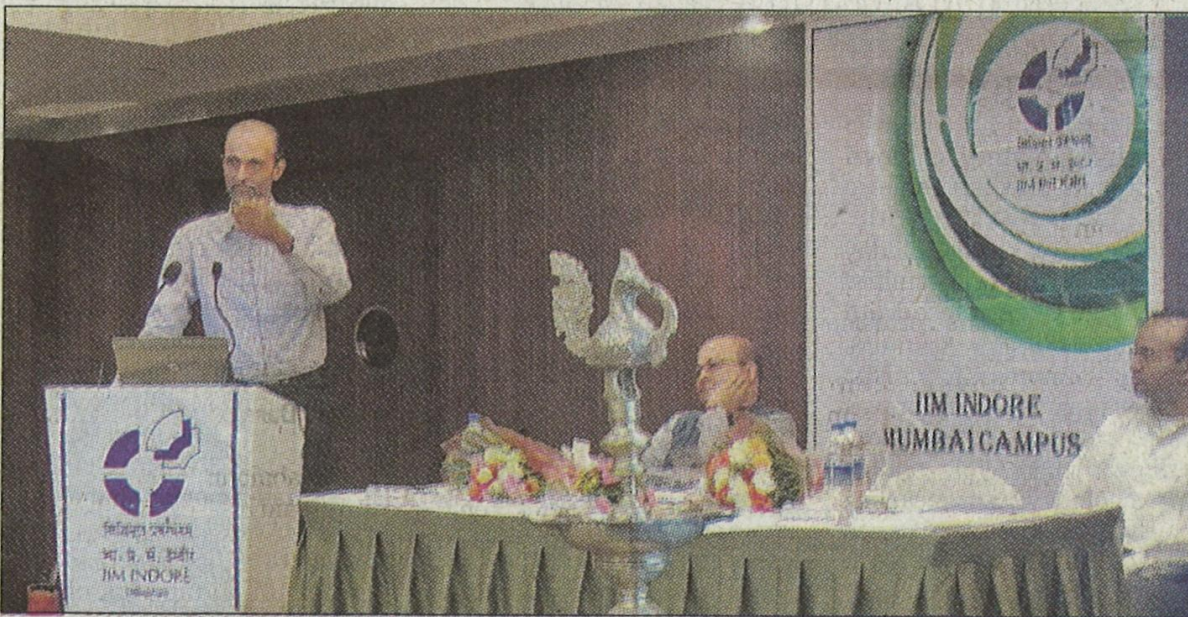
An orientation programme for third batch of Post Graduate Programme in Management (PGP) being held on Mumbai campus of IIM in Indore on Sunday.

The Q&A session saw inquisitive participants asking questions about the contribution of service sector to GDP and dependence of Indian economy on it.