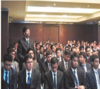
Students of the third batch of PGP-Mumbai during induction programme at Hotel Park, Navi Mumbai on Sunday.